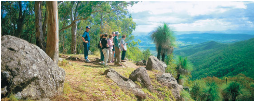
Guests of O'Reilly's Rainforest Escape go on a nature walk.

The ole' girl is looking pretty darned amazing or, dare we say, absolutely stunning. Tarraleah Lodge was built in the 1930s and underwent a brilliantly orchestrated facelift in 2006. Your clients are invited to meet this lovely, "lodgey" lady, don their kilts and travel not to bonnie Scotland , but to Australia's Tasmania and its Central Highlands . Equidistant between the cities of Strahan and Hobart , Tasmania's capital, the lodge is located on the famed touring route labeled by many Aussies as one of their country's top 10 drives.